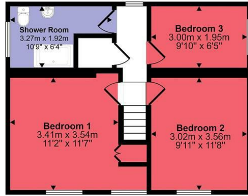
First Floor Approx 43 sq m / 467 sq ft